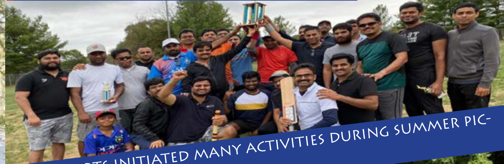
APTA SPORTS INITIATED MANY ACTIVITIES DURING SUMMER PICS ACROSS THE USA