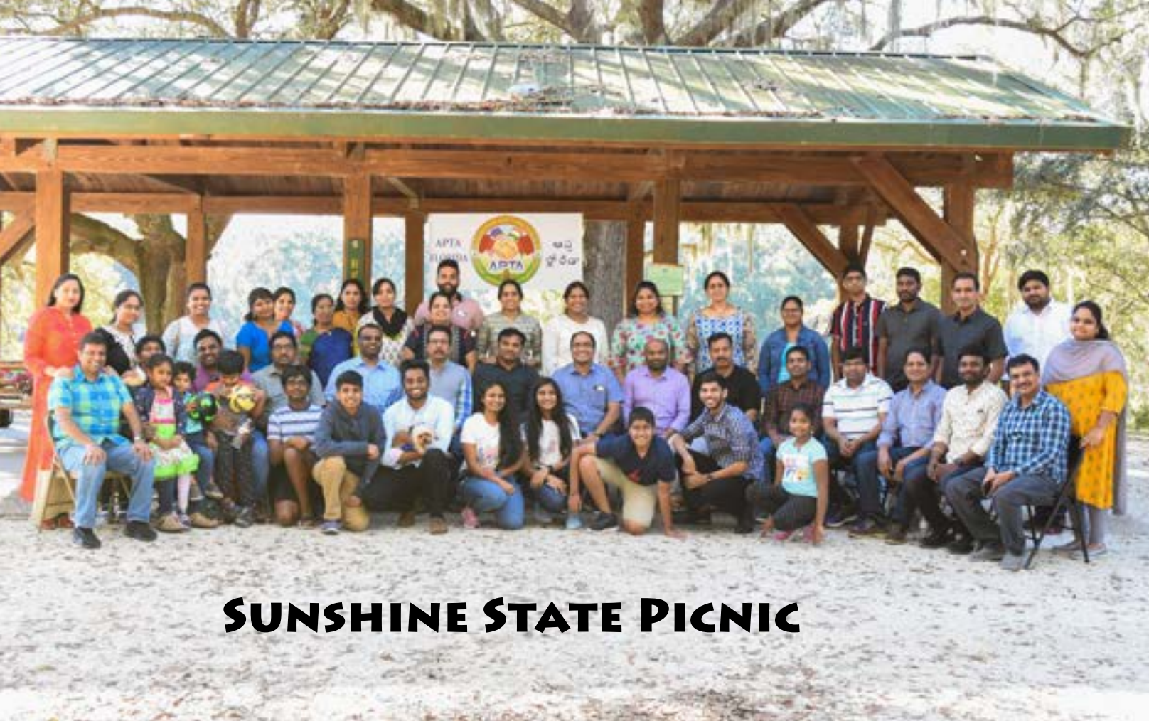
SUNSHINE STATE PICNIC