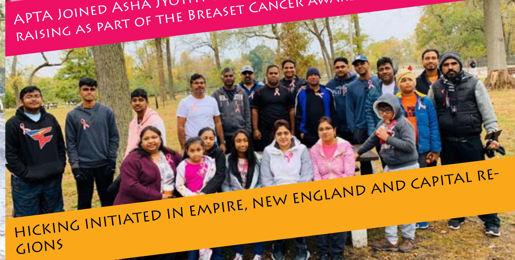
HICKING INITIATED IN EMPIRE, NEW ENGLAND AND CAPITAL REGIONS