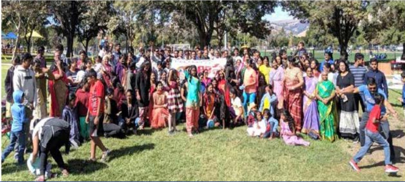
Bay Area Picnic